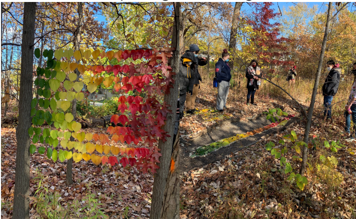
Students in STAM 203: Design in Nature stand near a project they constructed this fall. The class is co-taught by faculty in Biology and Art+Design.