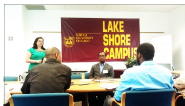
Scholars visiting U. of Loyola at Chicago.

D uring the month of July, McNair Scholars visited graduate programs at the University of Illinois at Chicago (UIC), Loyola University, and Northwestern University. The purpose of the visits was to introduce Scholars to faculty and provide insight regarding the application process at each institution.