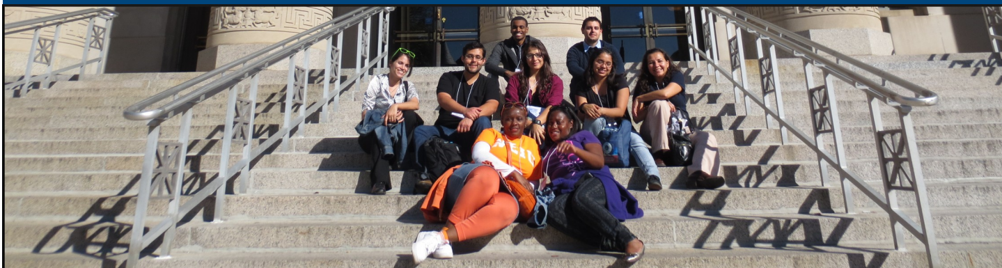
Scholars on the steps of University of Michigan

This summer, McNair Scholars visited Loyola University Chicago, University of Michigan, University of Chicago, University of Illinois at Chicago, and DePaul University. The purpose of these visits was to introduce Scholars to faculty and provide insight regarding the application process at each institution as well as to demonstrate the robust program set offered by each institution.