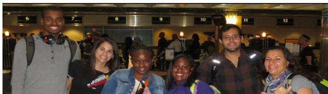
Scholars En Route to Conference

Scholars attended The National McNair Research Conference in November at the Grand Geneva Resort of Wisconsin. The conference, organized by the University of Wisconsin, was designed to provide undergraduate students with the opportunity to explore options of graduate study. Panel discussions, workshops, and activities all introduced McNair Scholars to the nature of graduate study and provided helpful tips and suggestions to aid in their writing of effective graduate admissions applications.