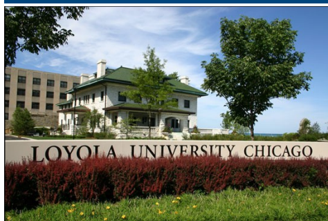
Scholars go to Loyola Campus