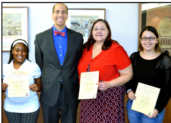
Who’s Who ceremony

Students at institutions across the nation are nominated each fall for the Who’s Who Among Students in Higher Education Award. Honorees are selected for outstanding academic achievement and service to the university and community at large. The following members of the McNair Scholars Program were selected for the award this year: