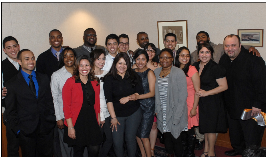
Graduating and Inducted McNair Scholars at the 11th NEIU McNair Annual Dinners