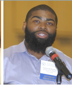
Universal Prayther, Health and