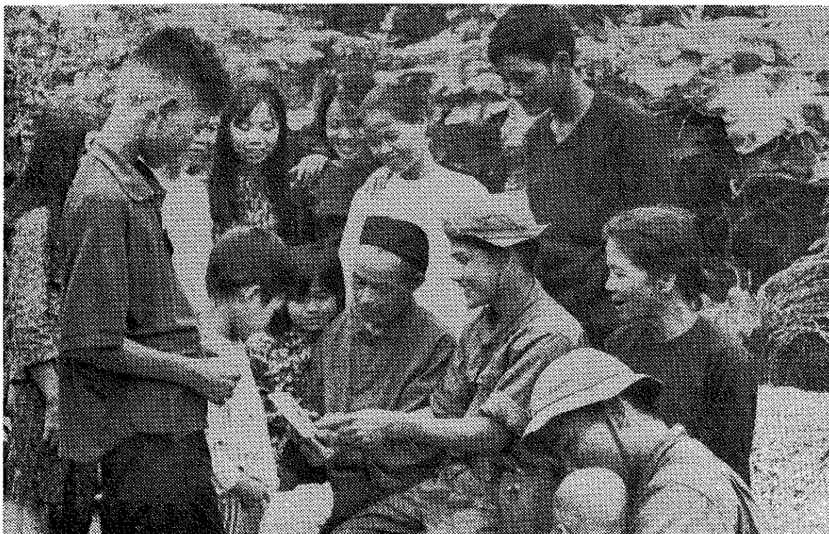
Nothing is happier than seeing President Ho's portrait again after nearly 2 decades under US-puppet rule

by a power-house in the backyard Military police stand guard day and night. The Americans boast that all building materials came from the United States and that plans were drawn and construction supervised by a renowned American military engineer, at the cost of 2.25 million dollars. In early 1971, in an interview with a French journalist, Bunker bragged about the solidity of this "White House" on the eastern shore of the Pacific. The unimpressed Frenchman replied with a wry smile: "Mr Ambassador, in my opinion, the fortress style of the embassy building suits your name rather than ambassadorial functions." Bunker's face showed that he was not amused by the play on word. In fact, Bunker was no ordinary ambassador and the unusual style of his residence indeed fits his unusual assignment.