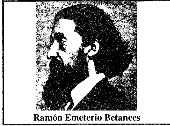
Ramón Emeterio Betances