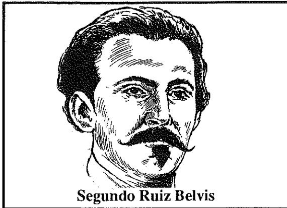
Segundo Ruiz Belvis