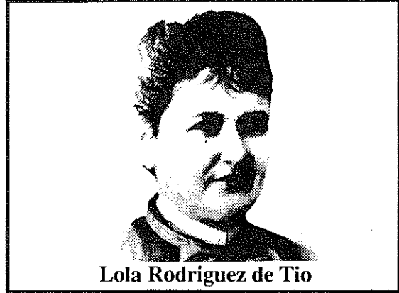
Lola Rodríguez de Tío

Some of the gains obtained from the Lares uprising were: the abolition of slavery and the hated *libreta system, the democratization of Spain as well as the positive influence it had on the Cuban revolutionary struggle and " El Grito de Yara ," Cuba's cry for freedom. A stronger unity grew between Puerto Rico and Cuba. This can be better appreciated in the following three statements: