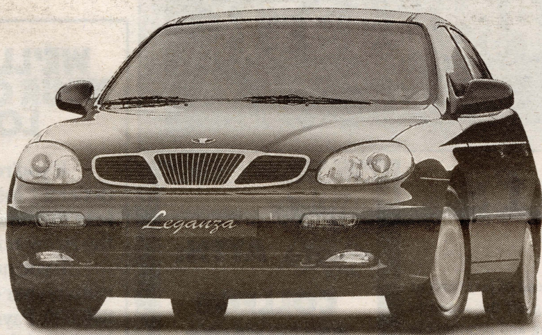
Leganza™ CDX 4-door Sedan