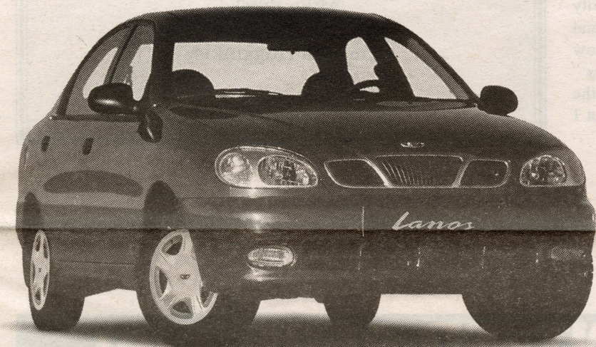
Lanos™ SE 4-door Sedan

You're also getting a great investment if you buy a Daewoo before 6/30/99. Because when you're ready to trade-in your used Daewoo for a new Daewoo, we'll match the trade-in value to the best selling car in its class.** It's a guaranteed way to get the most value out of your car. And it's only available from Daewoo. And only for college students. To learn more about Daewoo, stop by a Daewoo Store or talk to a Daewoo Campus Advisor. And find out how easy it is to finish your four years on four wheels.