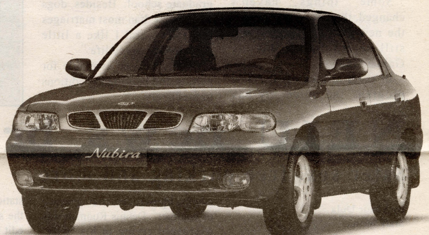
Nubira™ CDX 4-door Sedan