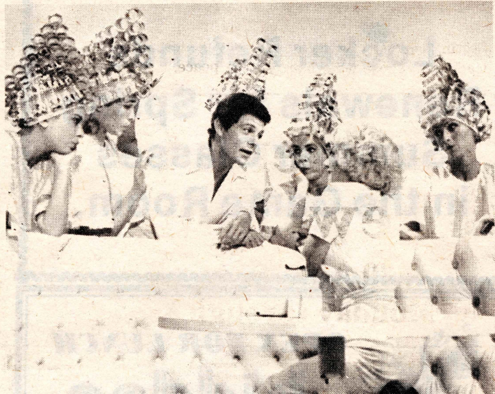
Frankie Avalon Serenades a Beauty School Dropout in "Grease"

Will I miss the laughs and Friends? Burocracy that gives me fits? Will I miss the teachers too? My friend, I'll miss all of it.